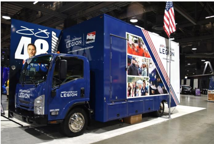
Drivers side of the TAL Experience Van.