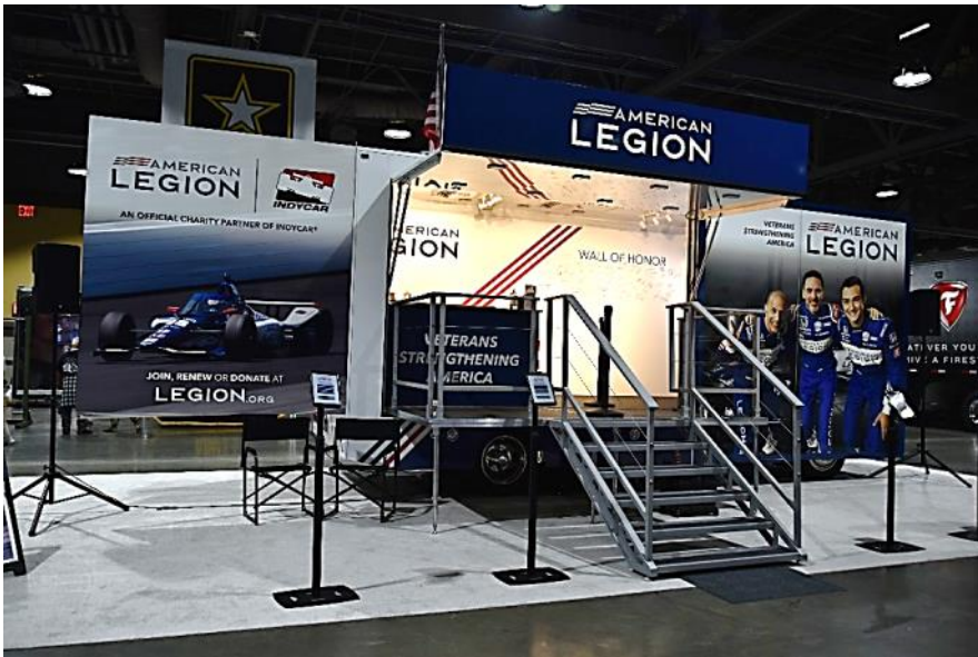
Public side of the van with panels folded out, and the reception counter, and the information kiosks.